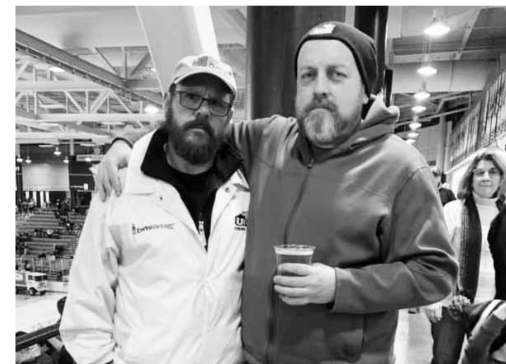
KEEP CALM AND DRINK BEER!!