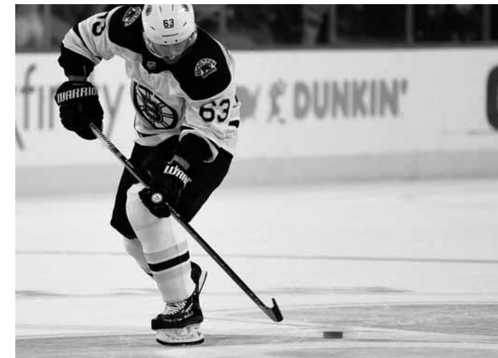
MARCHAND WHIFFS ON PENALTY SHOT