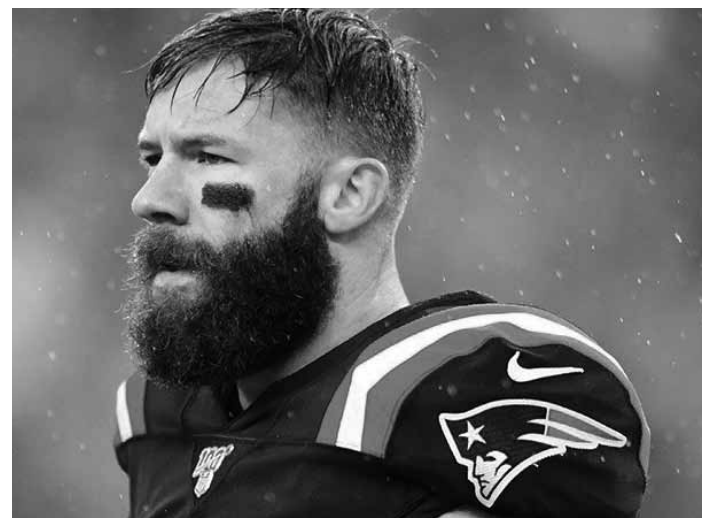
EDELMAN ARRESTED IN LA