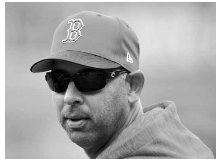
ALEX CORA OUT

Boston sports are in trouble with various issues, only President Dave offers sage advice to the locals!